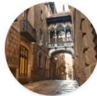
Gothic Quarter (Barri Gòtic)