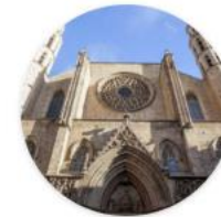
Santa Maria del Mar