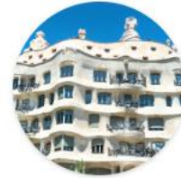
Casa Milà (La Pedrera)