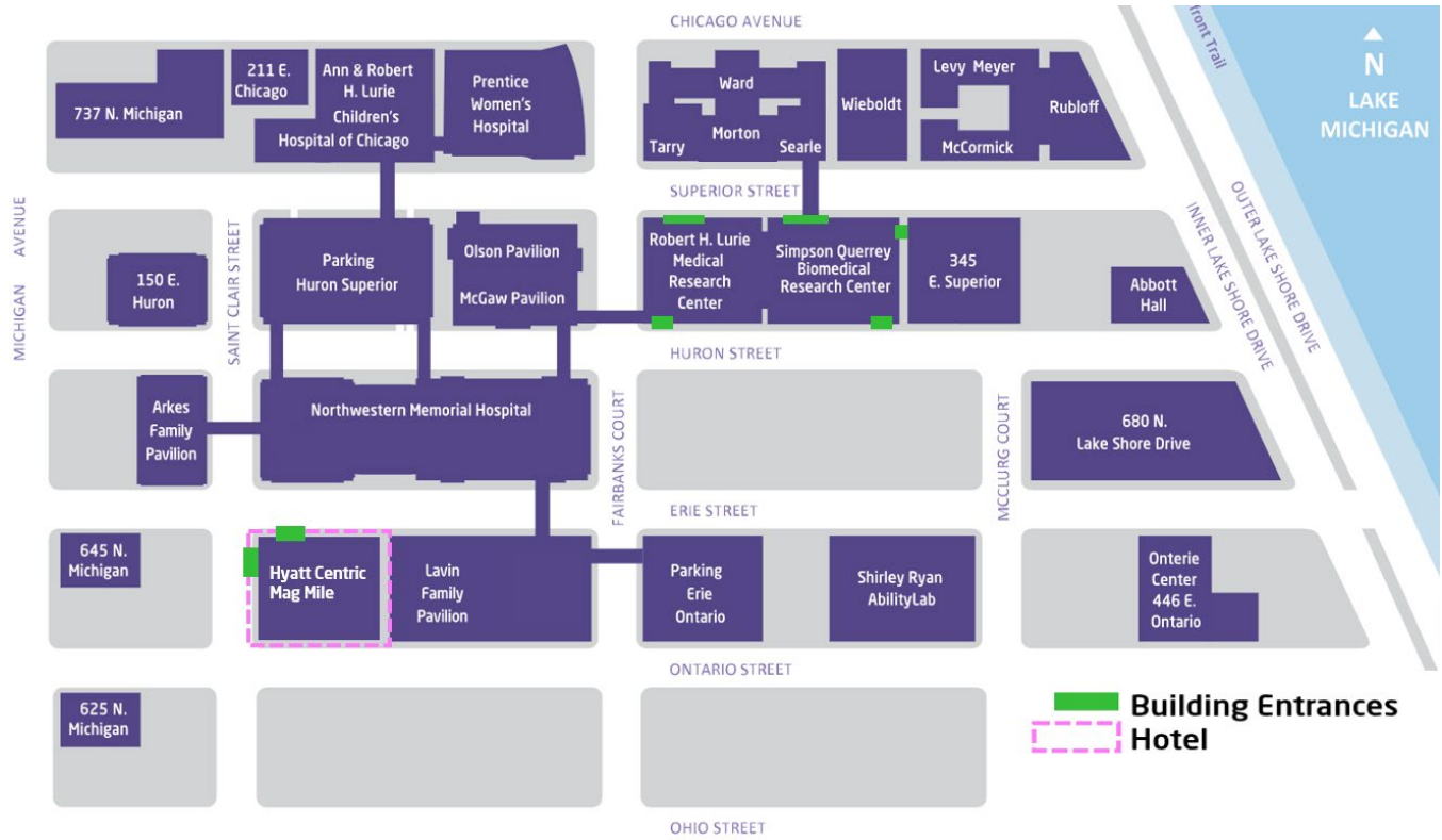
Northwestern University Campus Map